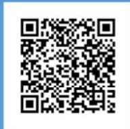
QR Code for Enrollment

Spanish: https://www.childplus.net/apply/es/08BC84CA4E86820CF1C57D1553337607/30C1E5268B67E773A0D73409A6254E09