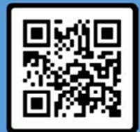
QR Code for Enrollment (Spanish Speakers)

Follow us on Instagram www.instagram.com/hrcap_headstart